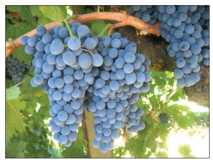
'Rougett' clusters.

would fit into a later crushing program in a warm climate because of its low bunch rot potential and retention of high acidity and low pH.