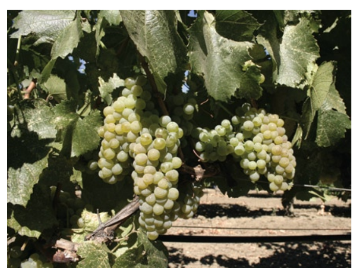
Clusters of Chardonnay FPS 04 hang in the foundation vineyard at FPS. One of the FPS selections constituting 'clone 108,' it was widely planted and included in most field trials.