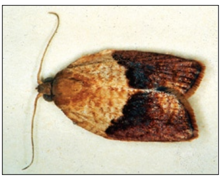
A male light brown apple moth showing distinct dark coloration on the distal half of the forewing. Wing coloration can vary considerably.

pheromone of LBAM is available commercially and can be used with delta traps to detect male moths. Pheromone traps have been deployed throughout California by Agricultural Commissioner's offices as part of CDFA's detection program to establish the area of LBAM infestation.