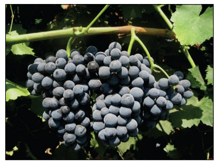
'Maxine Rouge' clusters.

vine and row spacing and trained to a bilateral cordon at 54 inches and with a foliar catch wire at 65 inches. They were pruned to 22 2-node spurs per vine. Higher node numbers may be used with vigorous vines due to the small clusters. The small clusters and upright vine growth might also make the variety suitable for quadrilateral vine training. The fairly open canopy minimizes the need for canopy manipulation. Close attention to fruit maturity and harvest date is needed due to the early ripening characteristics. The berries, especially when fully exposed to sun, begin to lose turgidity beyond 22 <sup>o</sup>Brix. The early ripening may require opening up a red wine crush program at an earlier date than usual for some wineries. Table wines made from the variety have been described as medium bodied with good color and mouth feel and of excellent acidity. The flavor profile is fresh red to dark fruits, and it can have some herbaceous flavor as well. It has been described as similar to Cabernet Sauvignon or Ruby Cabernet if the fruit is fully ripe.