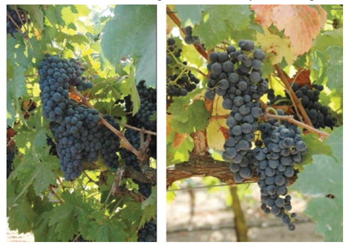
Zinfandel (left) and Primitivo in a comparative field trial in Lodi, California.

Finally, a study to compare 63 Zinfandel clones and field selections was initiated in 1995 on vines grown in the Zinfandel Heritage Vineyard located at the University of California's Oakville Experimental Vineyard in Napa